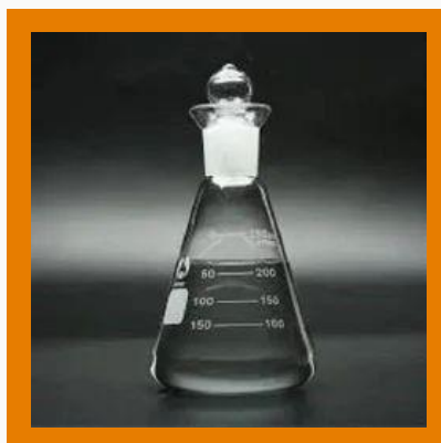
Hydrochloric Acid Pharma Grade