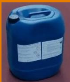
DBNPA (2,2-DIBROMO 3- NITRILOPROPIONAMIDE) (CAS NO – 10222-01-2)