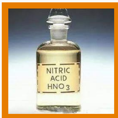
Nitric Acid C.P. grade 70%