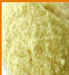
3-AMINO ACETOPHENONE (CAS NO – 99-03-6)