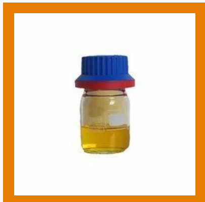
Nitric Acid C.P. Grade 60%