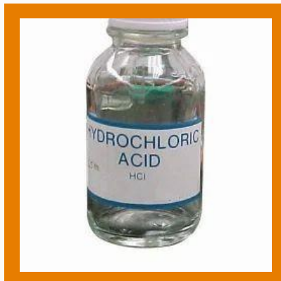
Hydrochloric Acid L.R. Grade