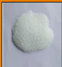
Bronopol Technical Grade (CAS no: 52-51-7)