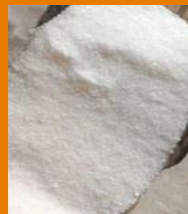
Bronopol IP/BP Grade (2-BROMO 2-NITRO 1/3- PROPANEDIOL)