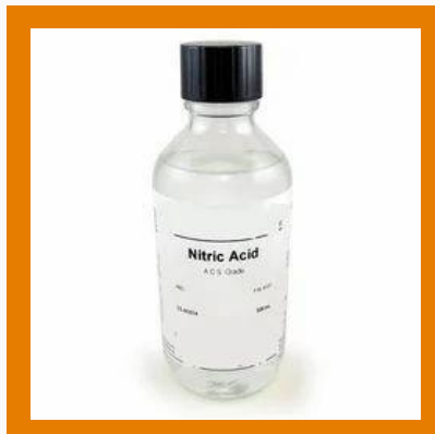
Nitric Acid A.R. Grade