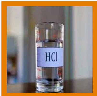
Hydrochloric Acid A.R. Grade