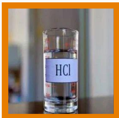
Hydrochloric Acid C.P. Grade