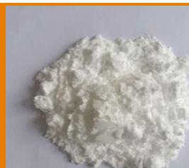
PIROCTONE OLAMINE (CAS NO – 68890-66-4)