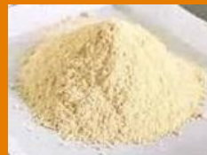
3-HYDROXY ACETOPHENONE (CAS NO – 121-71-1)