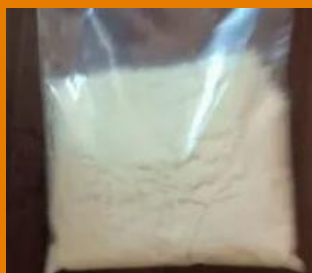
3-NITRO ACETOPHENONE (CAS NO – 121-89-1)